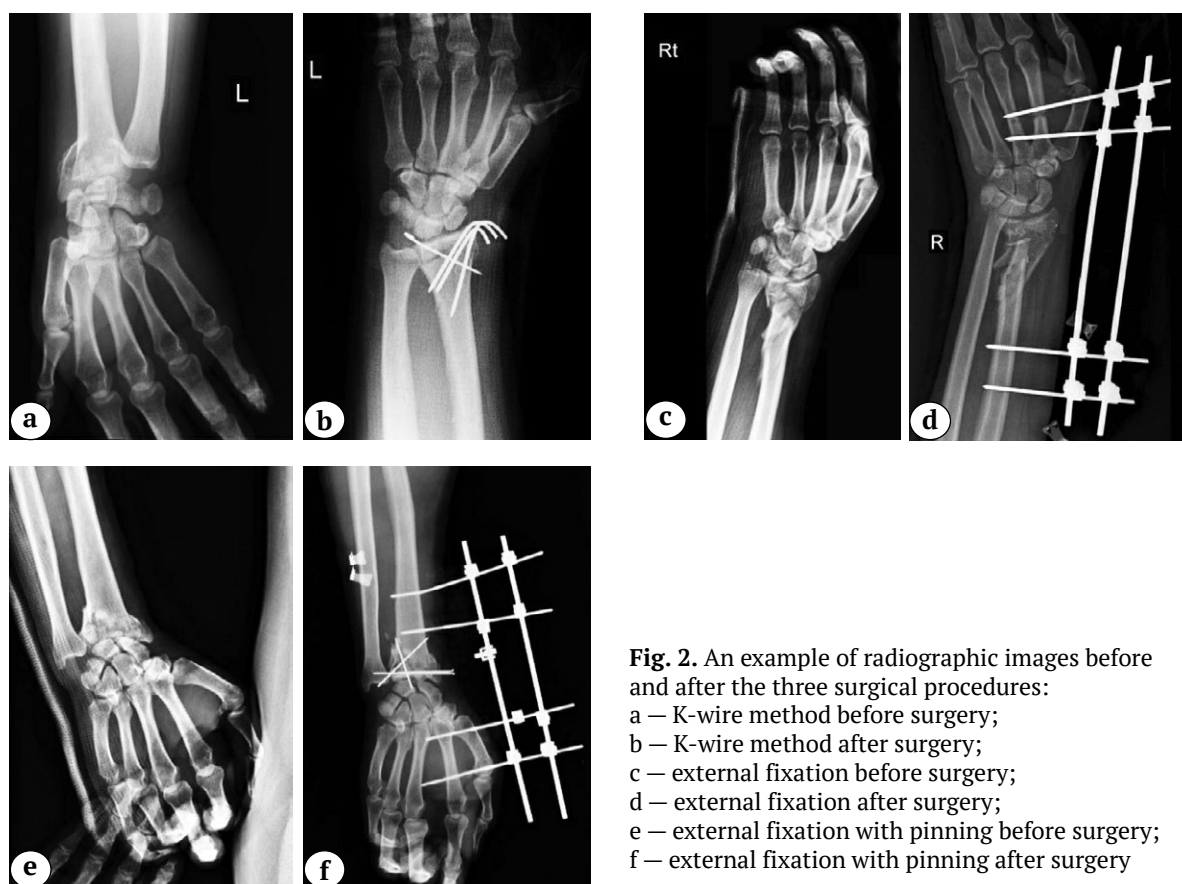
Fig. 2. An example of radiographic images before and after the three surgical procedures: a – K-wire method before surgery; b – K-wire method after surgery; c – external fixation before surgery; d – external fixation after surgery; e – external fixation with pinning before surgery; f – external fixation with pinning after surgery