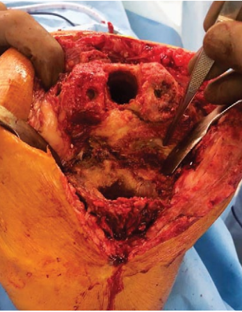
Fig. 2. Defects of the distal femur and proximal tibia