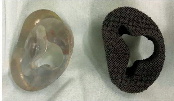
Fig. 3. An individual implant made on a 3D printer