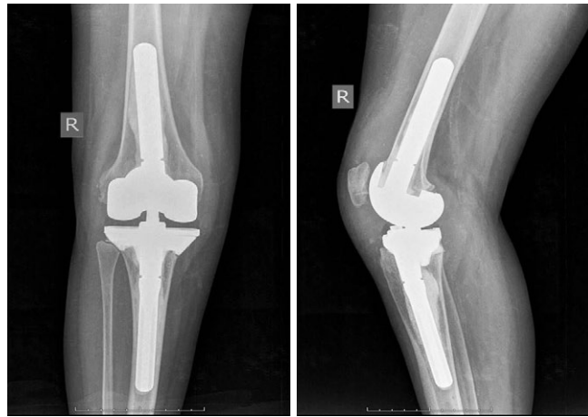
Fig. 5. Postoperative X-rays of the right knee in direct and lateral projections