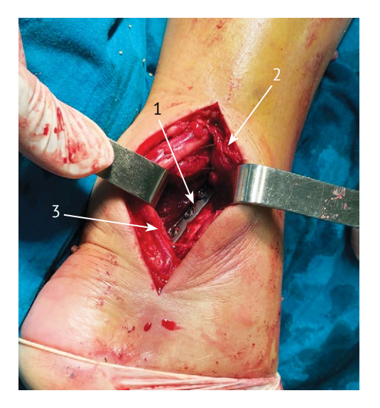
Fig. 2. Intraoperative image of the posteromedial approach at the stage of fixation of the posterior edge of the tibia with a 1/3-tubular plate:

Fixation of the fragment of the posterior edge of tibia was performed using cancellous screws 4.0 mm with partial thread in 6 cases and plates in 16 cases. Short 1/3-tubular plates with 3-5 holes, T-shaped plates from a set for fixing small bone fragments were used, introducing 3.5 mm cortical screws and 4.0 mm cancellous screws with partial thread (Fig. 2). The reduction of the medial malleolus was performed via the anterior window of the posteromedial surgical approach with its fixation with two cancellous screws 4.0 mm with partial thread in 15 cases, one screw and a K-wire - in 3 cases of comminuted fractures, and 1/3-tubular plate with 3.5 mm screws – in 1 case with a vertical fracture line. In 2 patients without bone injury to the medial structures of the ankle joint, the suture of the deltoid ligament was not performed, since foot subluxation could